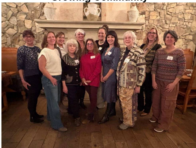
2025 Volunteers at the Volunteer Appreciation Event.

We are an all-volunteer, nonprofit membership organization sustained by the generosity and engagement of people who believe in the power of the arts. Your support makes our work possible and helps strengthen a vibrant, connected arts community.